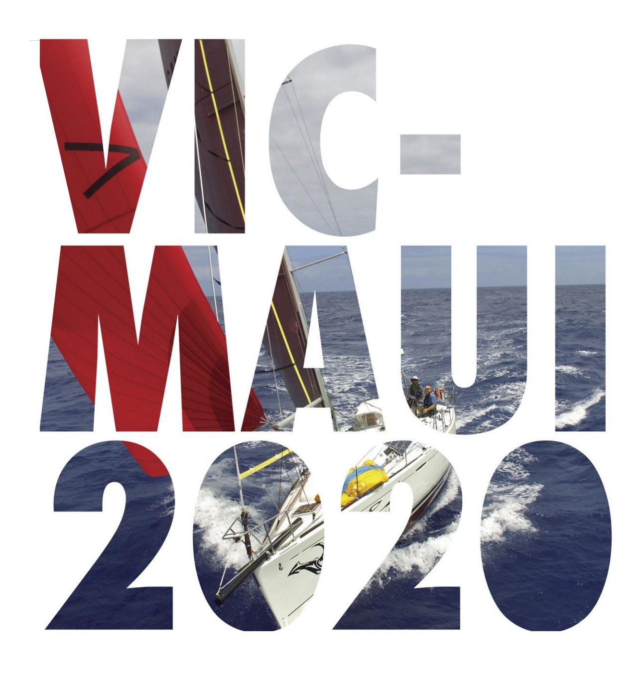
2020 Victoria to Maui International Yacht Race